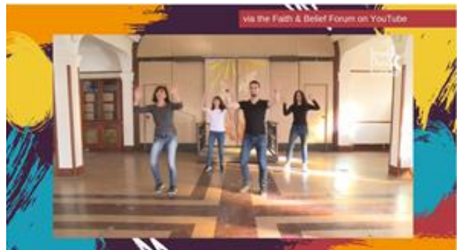
Israeli folk dance session with Israeli Dance Institute