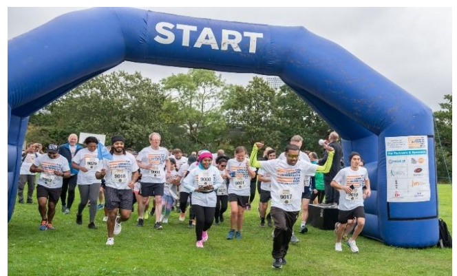
Attendees starting the 5k and 10k routes together